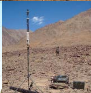
Acoustic Detector System