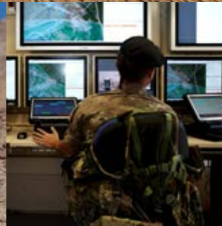
Command & Control