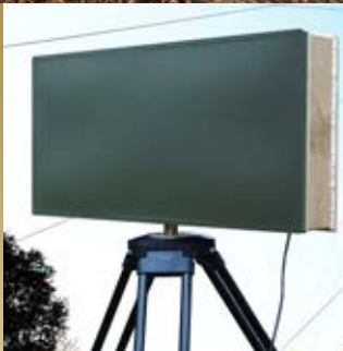
Ground surveillance radar