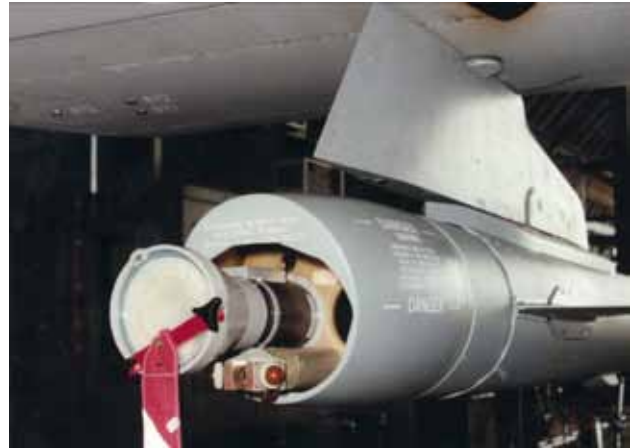
ARIEL pod on RAF Tornado

The equipment employs countermeasures techniques which are fully programmable by the user to enable the decoy to be used for a stand alone operation, or as part of a fully integrated Self Protection System.