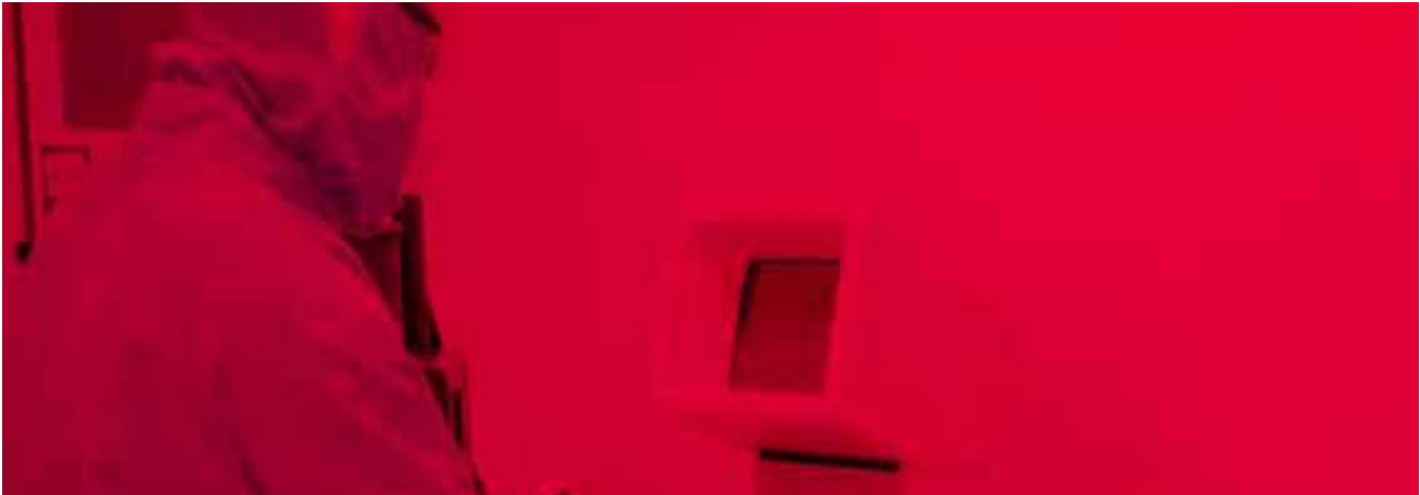
Detector production and test facilities