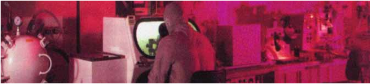
Detector production and test facilities