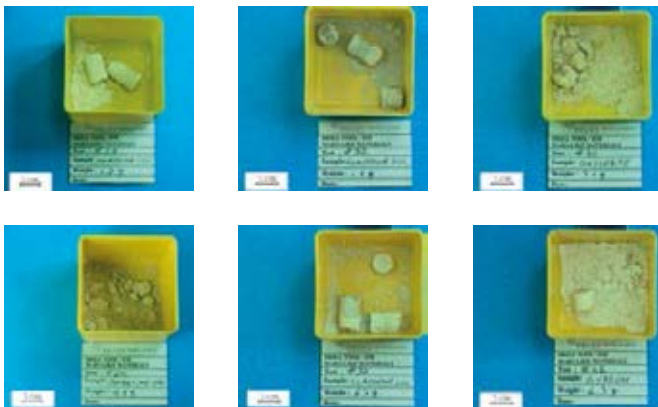
Example of collected samples: sandstone, claystone and hydrothermal deposits (geyserite) and gypsum.

Many samples have been collected in the different conditions and some examples are provided below.