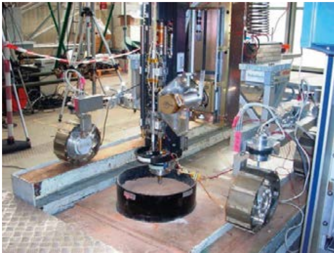
The Drill System integrated on to the Exomars Rover breadboard during the relevant test campaign.

Many samples have been collected in the different conditions and some examples are provided below.