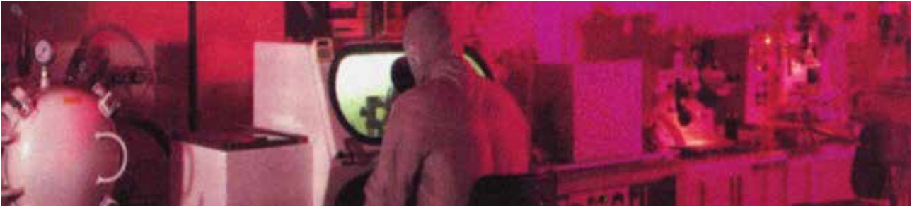
Detector production and test facilities