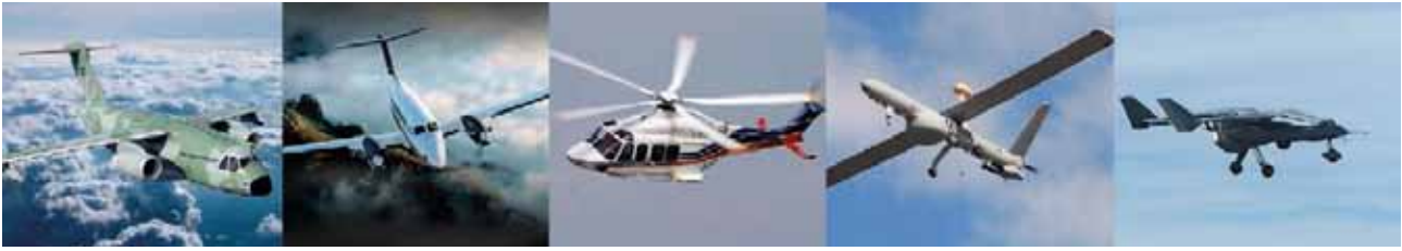
Gabbiano Radar Family's high level of modularity and flexibility makes it suitable for Unmanned Aerial Vehicles as well as both fixed and rotary wing manned platforms.