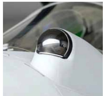
Pirate infrared search and track system

For more information please email infomarketing@selex-es.com