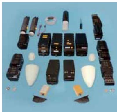
DASS detection and protection system